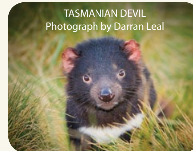
TASMANIAN DEVIL

Forest & Heritage Centre Geeveston (55 minutes from Hobart)