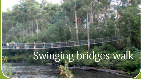
Swinging bridges walk