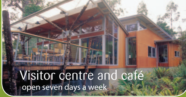
Visitor centre and café open seven days a week

Did you know that some of the tallest trees in the world grow in southern Tasmania? The Forest and Heritage Centre in Geeveston is the place to visit if you want to learn more. As a bonus to the AirWalk's admission fee, entry to the centre is included as part of your forest experience.